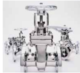
Duplex Stainless Steel Valves