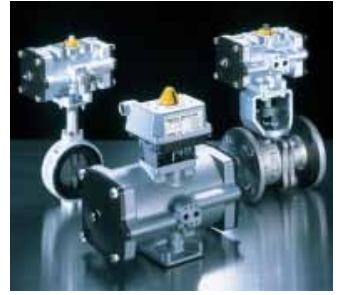
Pneumatic Actuated Valves