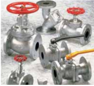
Ductile Iron Valves