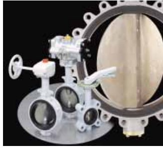
Ductile Iron Butterfly Valves