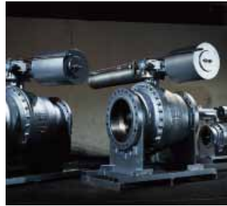
Steel Ball Valves, Trunnion Ball Design