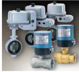
Electric Actuated Valves